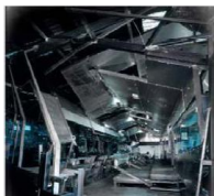
VOID Interior of Bobco Metals Co., Los Angeles, 2004