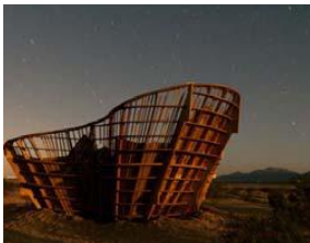
Ball-Nogues Studio Yucca Crater Installation near Twentynine Palms, California, 2011

Permission has been granted for a one-time reproduction during the above-captioned period (print and online media only— special permission must be granted for multimedia use ). Alteration of the image in any way—cropping, detailing, overprinting, etc.—is not permitted.