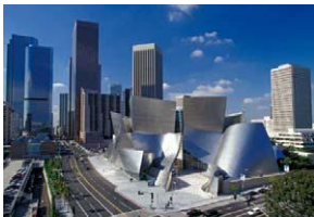
Gehry Partners Walt Disney Concert Hall, Los Angeles, 2003