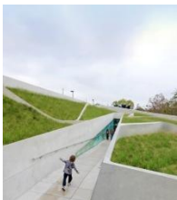
Belzberg Architects Los Angeles Museum of the Holocaust, Los Angeles, 2010