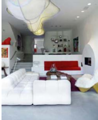
Greg Lynn FORM, in collaboration with Lookinglass Architecture & Design interior of Bloom House, Southern California, 2012