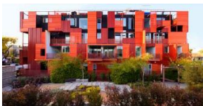
Lorcan O'Herlihy Architects Formosa 1140, West Hollywood, California, 2008