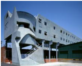
Eric Owen Moss Architects Samitaur, Los Angeles, 1996