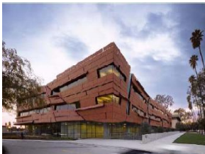
Morphosis Architects Cahill Center for Astronomy and Astrophysics at Caltech, Pasadena, California, 2008