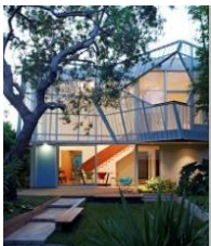
Daly Genik Architects Palms House, Los Angeles, 2011