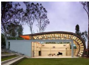
Hodgetts + Fung Wild Beast Music Pavilion, Valencia, California, 2009