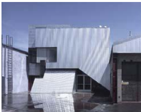
Brooks + Scarpa Architects Bergamot Artist Lofts, Santa Monica, California, 1999