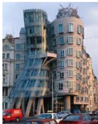
Frank O. Gehry & Associates Nationale-Nederlanden Building, Prague, Czech Republic, 1996